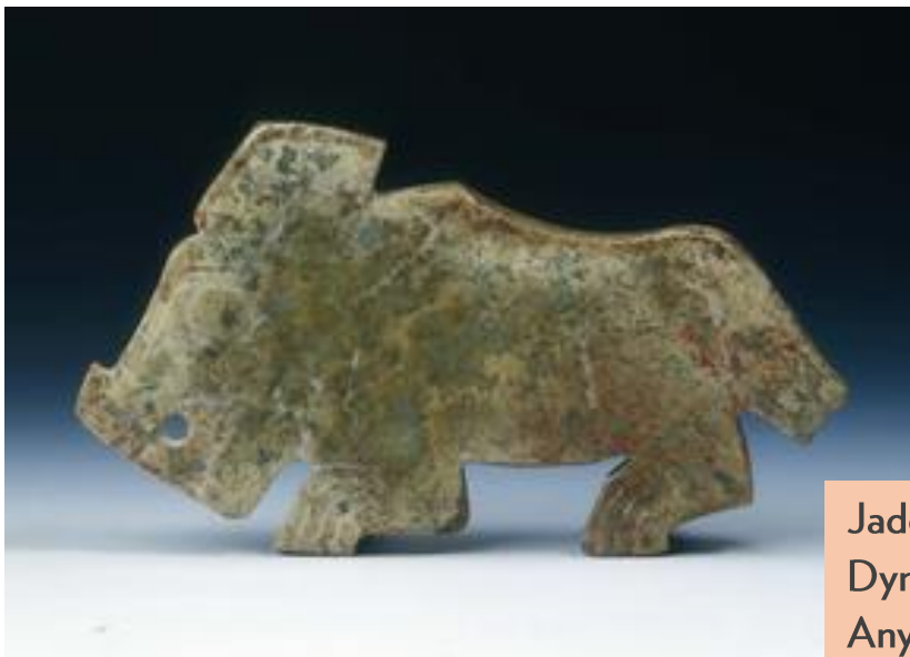
Jade Tiger Plaque, Shang Dynasty, made during the Anyang Phase c.1400- 1100 BC

The Shang Dynasty lasted for around 600 years and was ruled by a series of approximately 30 kings. In 1050 BC, the last king of the Shang was overthrown by the Zhou. With a reputation for partying instead of caring for his people, this king was so despised that when the Zhou came to take over the throne, very few people came to defend him. Upon his defeat, he burnt his own palace to the ground.