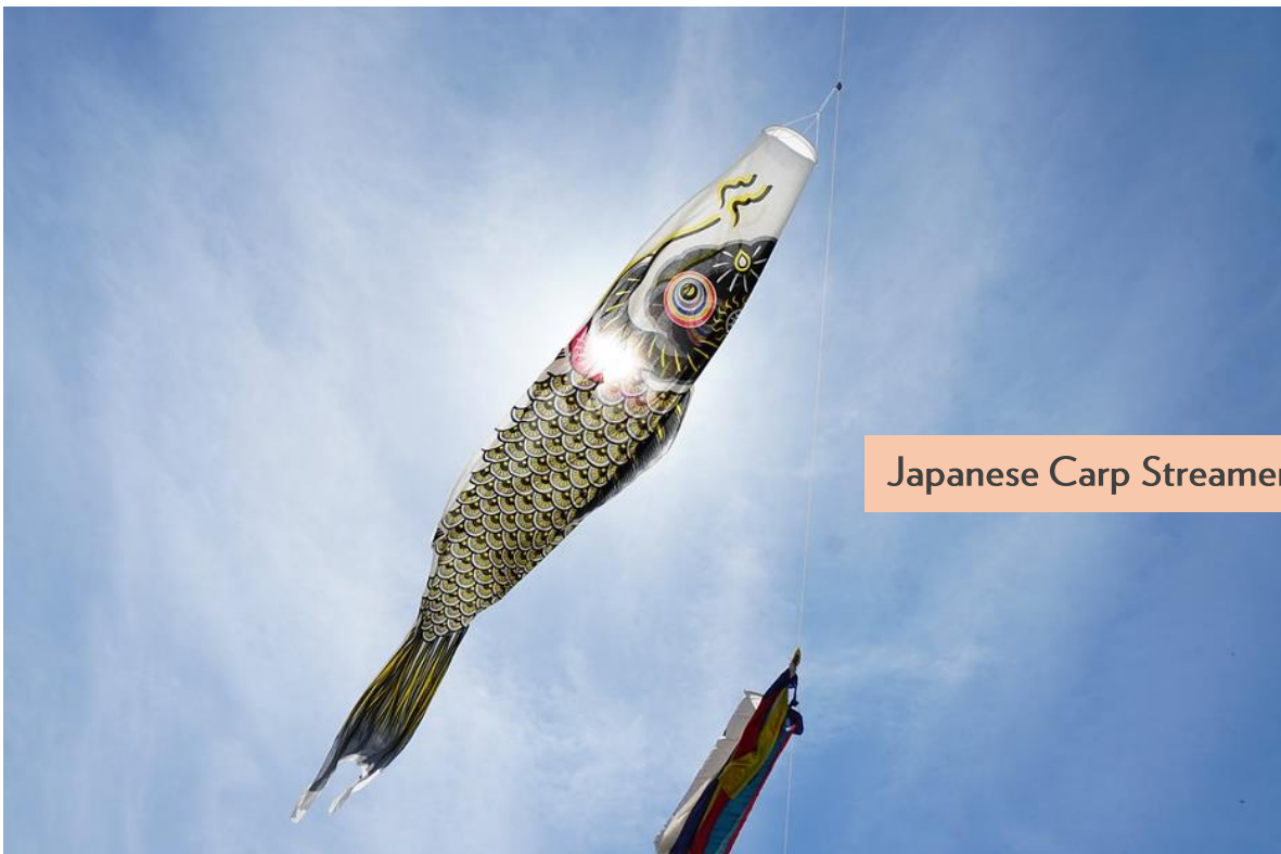
Japanese Carp Streamers or koinobori

Remember: You can look at the map on the previous page to find both China and Japan.